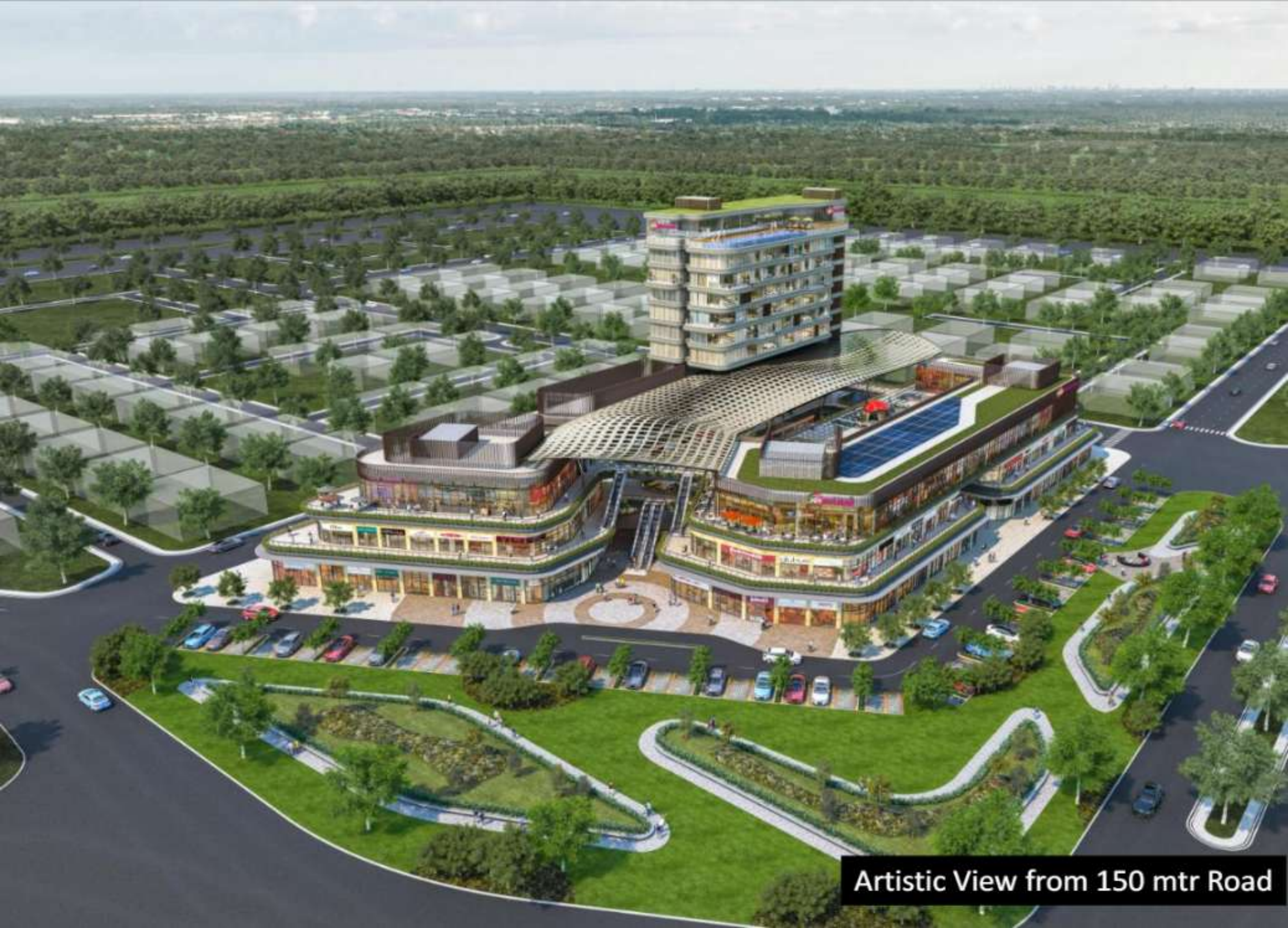
Artistic View from 150 mtr Road