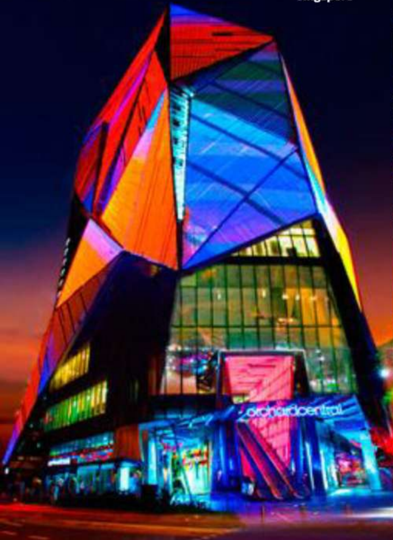
Orchard Central Singapore