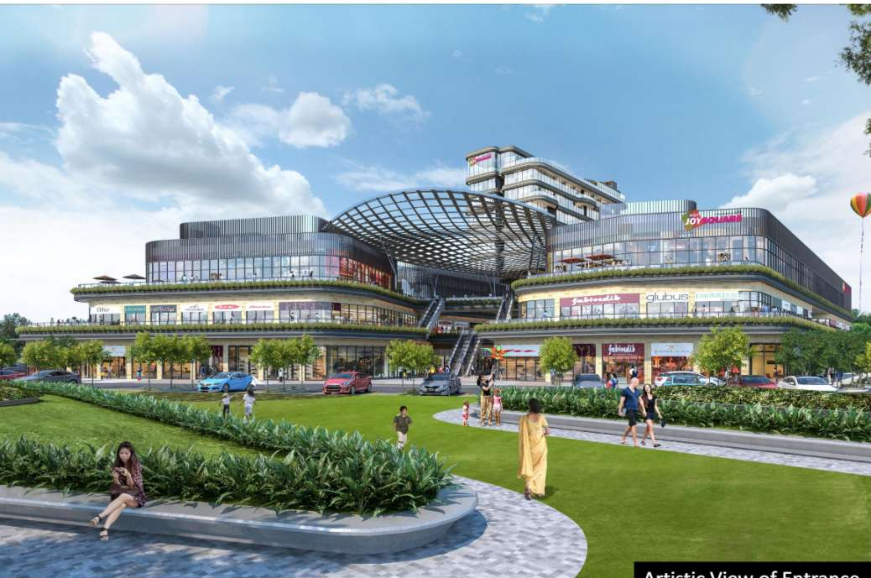
Artistic View of Entrance