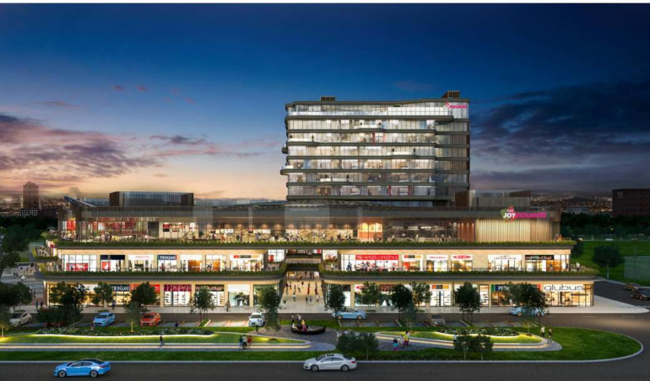
Artistic View from 84 mtr wide Road