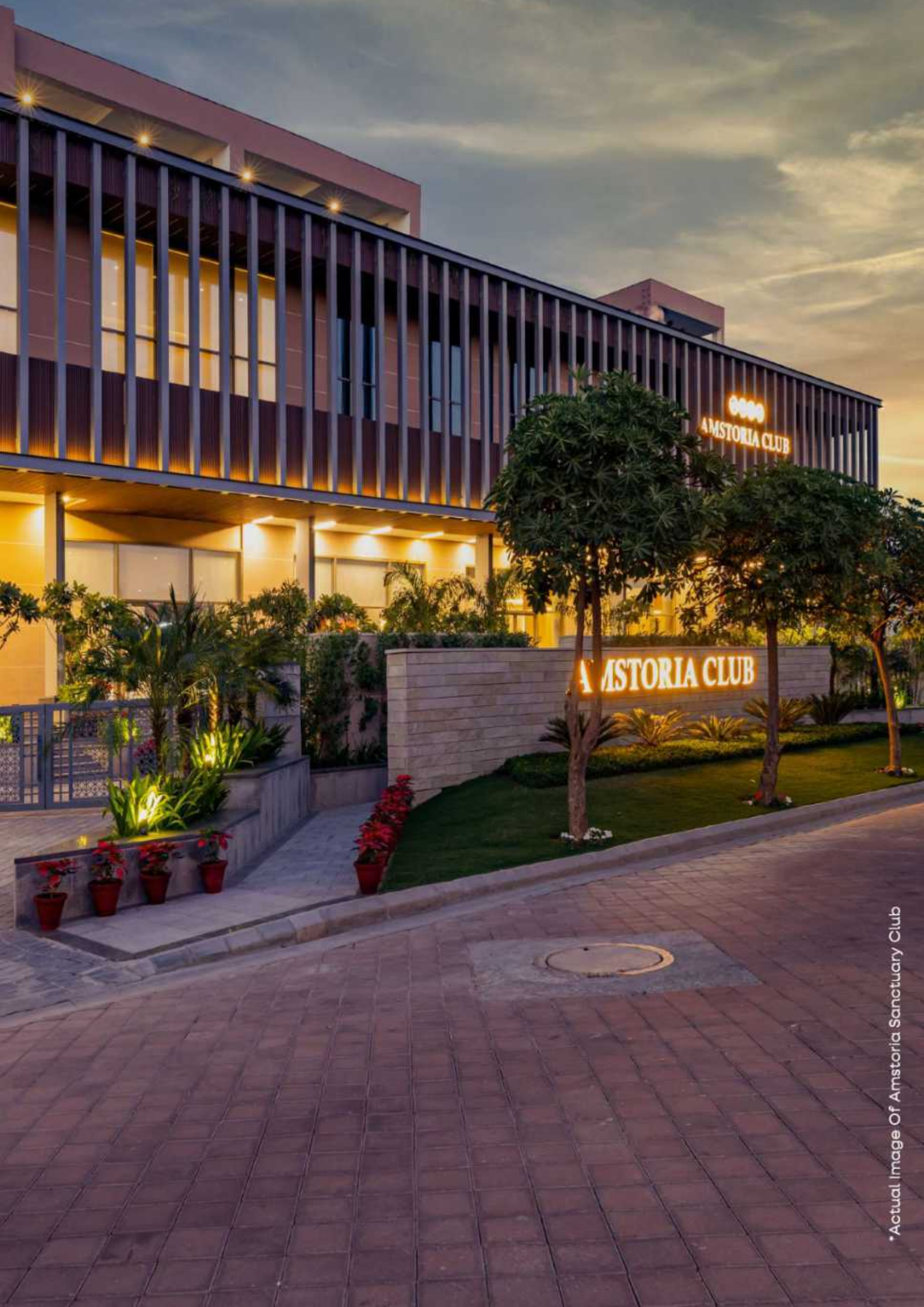
*Actual Image Of Amstoria Sanctuary Club

AMSTORIA SANCTUARY CLUB is an exquisite confluence of elegance and exclusivity, curated for connoisseurs of fine living. Crafted to promote a community lifestyle, it transcends the ordinary to deliver a lifestyle steeped in quiet grandeur and distinction.