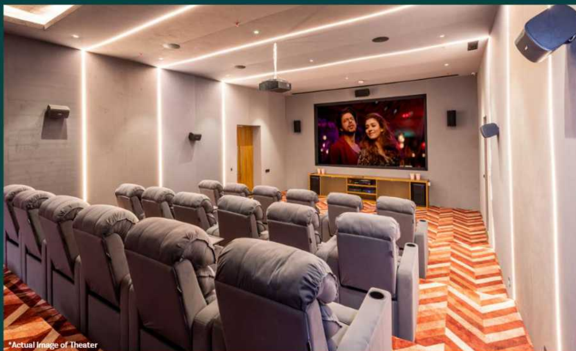
*Actual Image of Theater