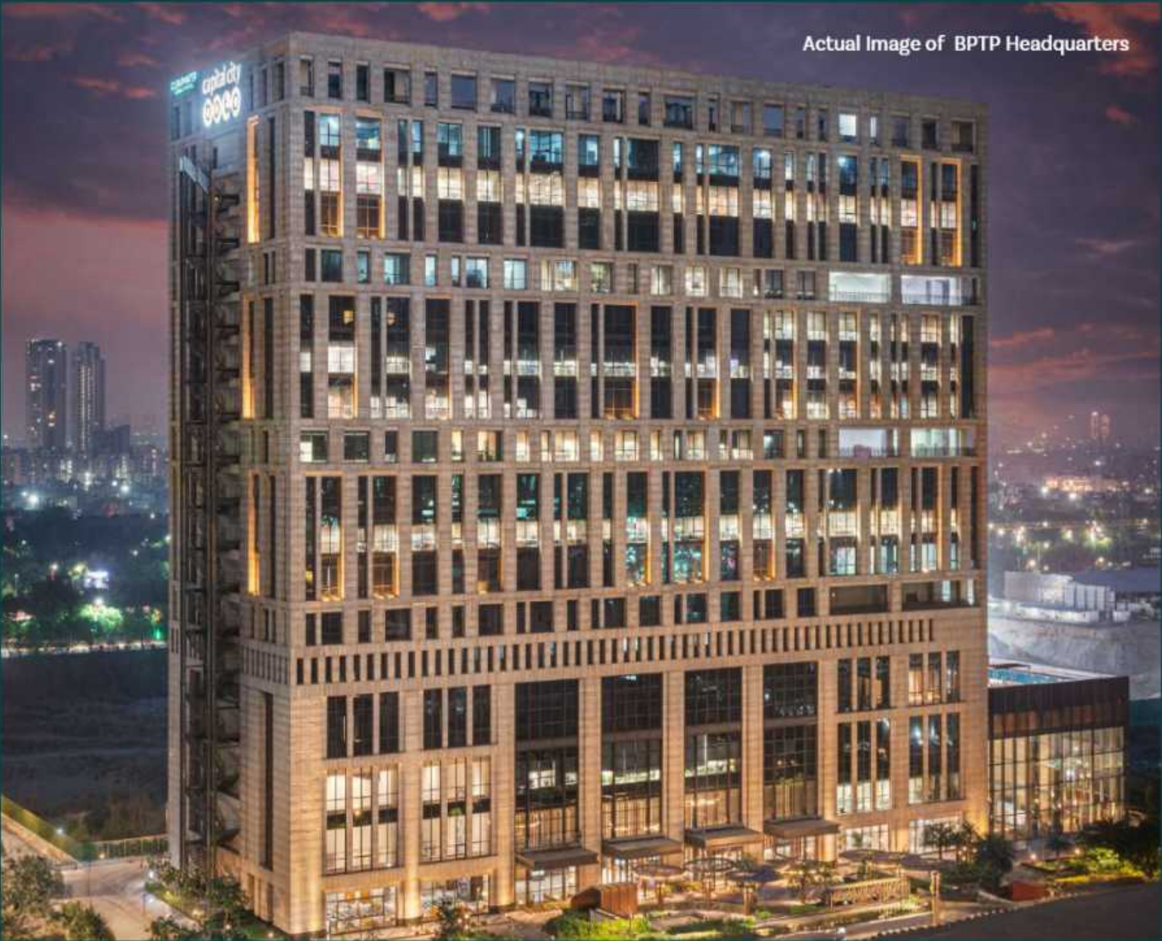
Actual Image of BPTP Headquarters