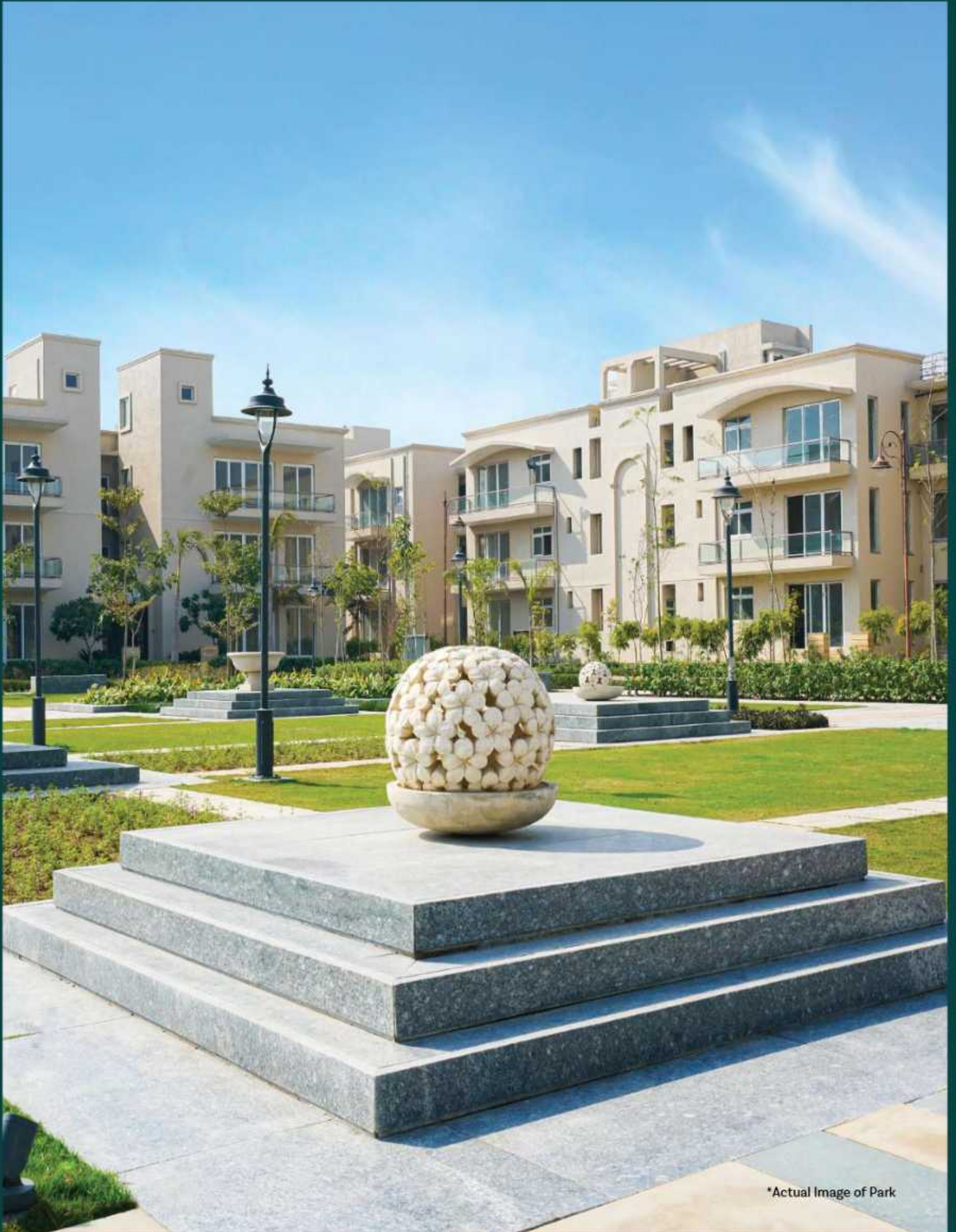
*Actual Image of Park

Amstoria 102 Eden Estate III, it's more than a home, it's an experience. Spread over an expansive ~143 acres of prime land, this township is a perfect representation of sophisticated living, meticulous planning and a long-term dedication to building community spirit.