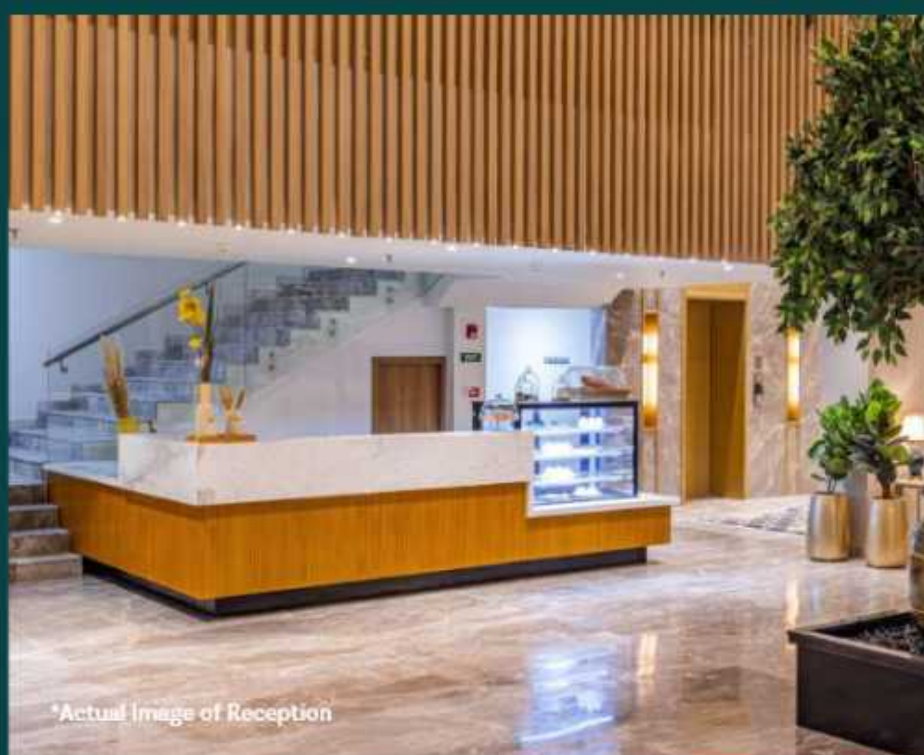
*Actual Image of Reception

For entertainment, enjoy vibrant gatherings in our AV room, where every moment is filled with excitement. Here, convenience and leisure harmoniously intertwine. Discover a limitless world that caters to your every desire.