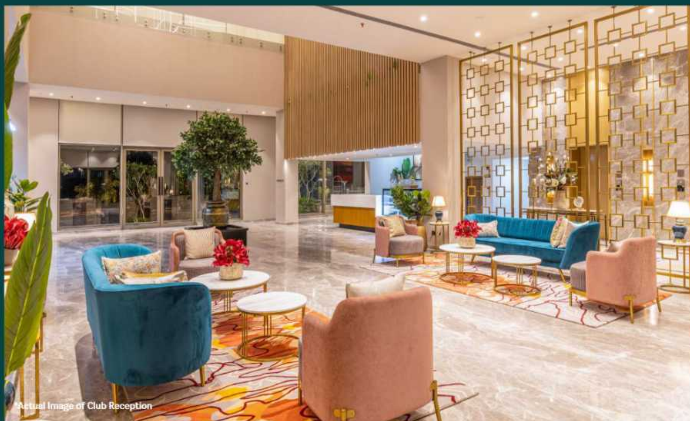
*Actual Image of Club Reception

For entertainment, enjoy vibrant gatherings in our AV room, where every moment is filled with excitement. Here, convenience and leisure harmoniously intertwine. Discover a limitless world that caters to your every desire.