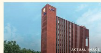
Max House, Okhla Completed in 2022