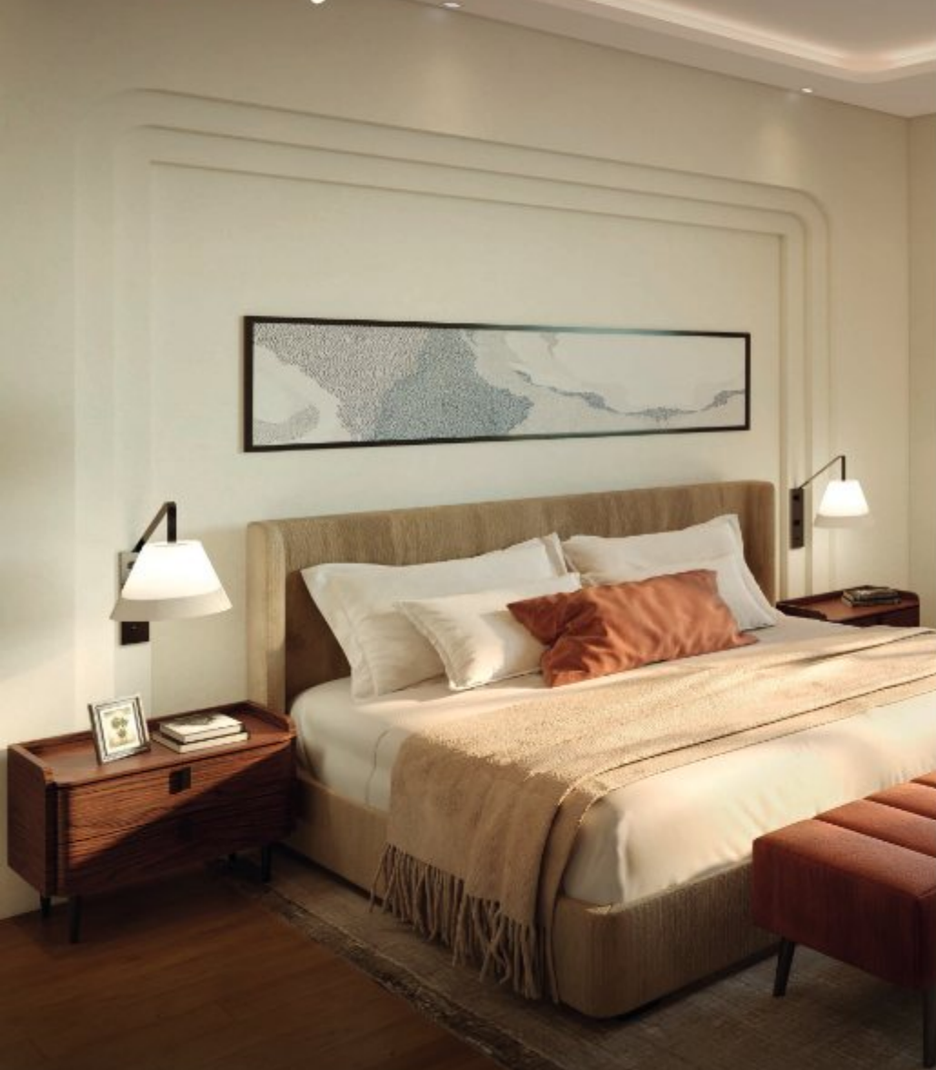
A view of an Estate 361 home.