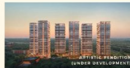
Estate 360, Gurugram Launched in 2024