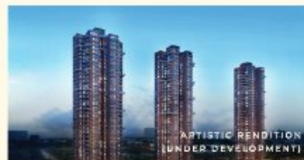
Estate 128, Noida Phase-I launched in 2023 Phase-II launched in 2024