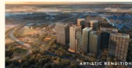
Upcoming LiveWell and WorkWell experience in Noida