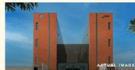
Max Square, Noida Completed in 2023