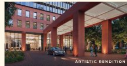
Upcoming LiveWell and WorkWell experience in Noida