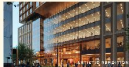
Upcoming WorkWell experience in Gurugram