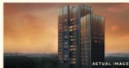
Max Towers, Noida Completed in 2019