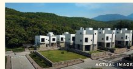
222 Rajpur, Dehradun Completed in 2018

With a vision to bring real well-being to real estate, Max Estates — the real estate arm of Max Group — has curated a diversified portfolio (18 million square feet) of grade-A+ sustainable residential and commercial developments, across various asset classes and key strategic locations throughout Delhi-NCR.