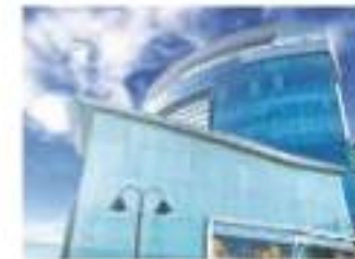
PARAS DOWNTOWN CENTRE