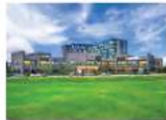
PARAS TRADE CENTRE