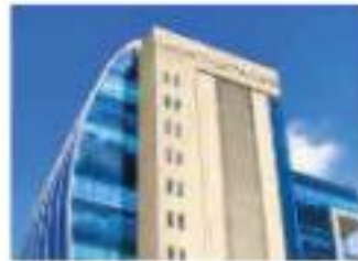
PARAS TWIN TOWERS