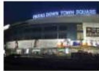
PARAS DOWNTOWN SQUARE