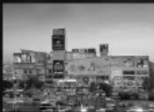
City Centre Mall 2001