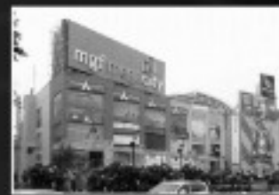
MGF Megacity Mall 2008