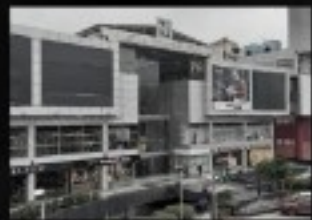
MGF Metropolitan Mall 2001