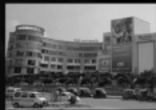
MGF Metropolis Mall 2010