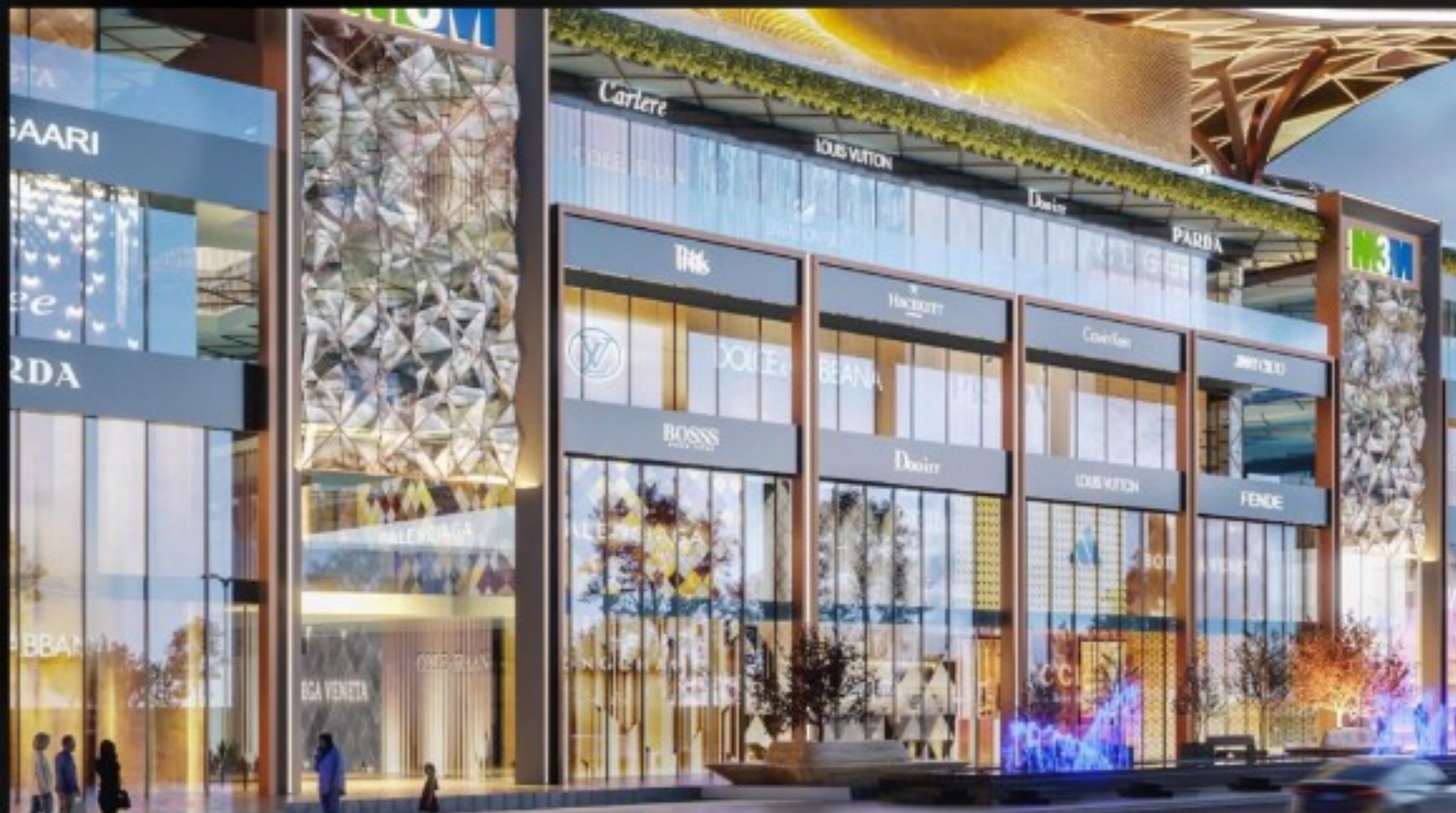
Large Glass Frontage