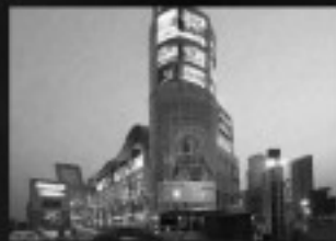
Grand Mall 2004