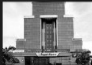
JMD Regent Square 2002