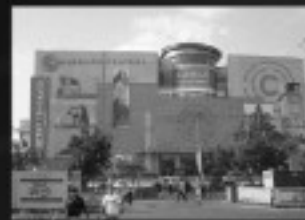
Central Mall 2008